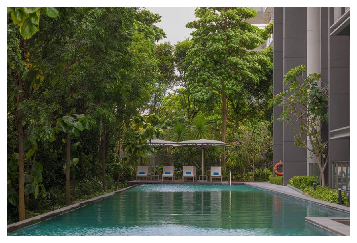
Lap pool surrounded by lush greenery at Fraser Residence Orchard, Singapore