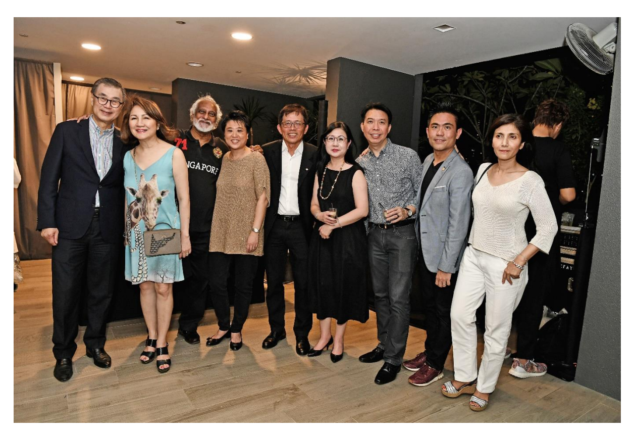
Representatives from Bukit Sembawang and Frasers Hospitality