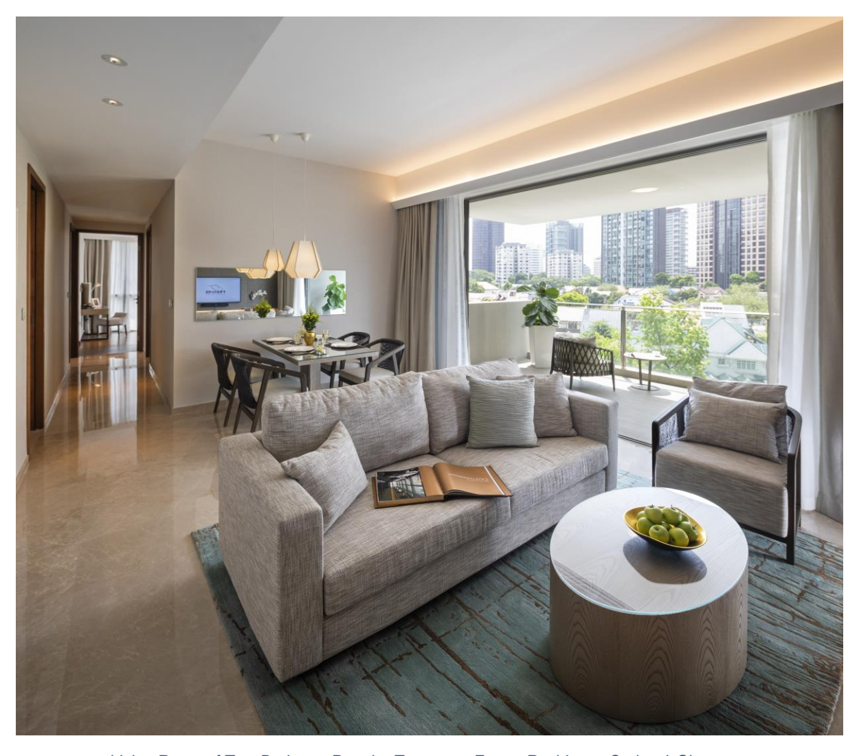
Living Room of Two Bedroom Premier Terrace at Fraser Residence Orchard, Singapore